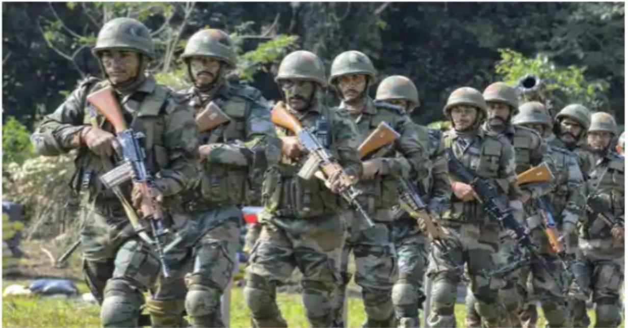
Representational image: Indian Army organises integrated exercise 'Trishakri Prahar' in North Bengal